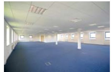
UNIT E FLOOR PLATE