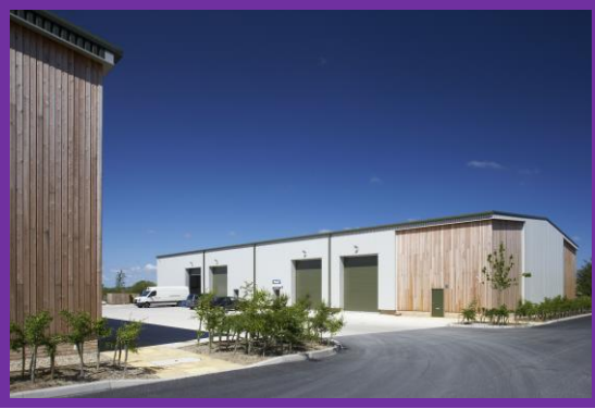
adjacent units at the development