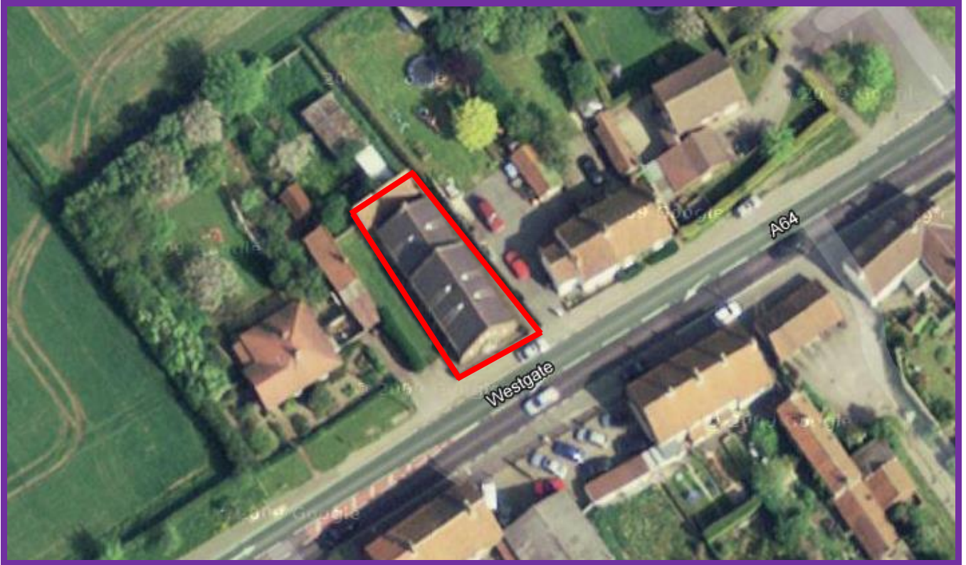
Boundary is approximate only and should not be relied upon