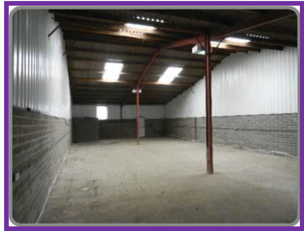
Example of Unit 17 interior