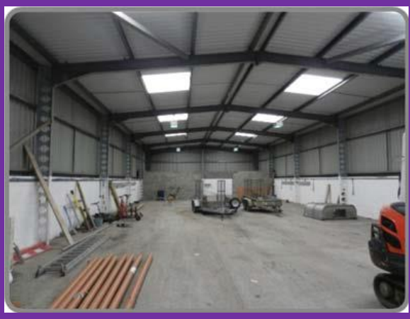
Unit 1a interior

or Lawrence Hannah - miles1@lh-property.com 01904 659 800: