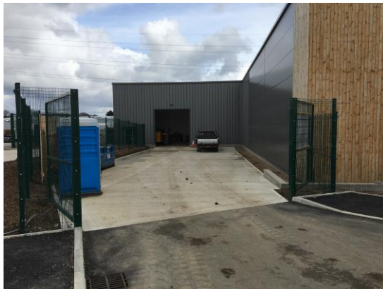
Plot 5a Unit 8