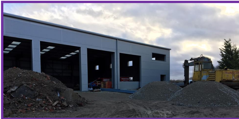
The buildings during construction