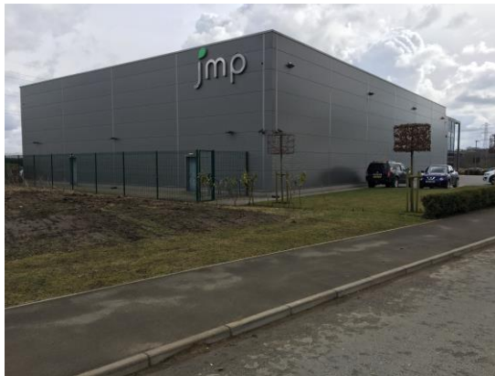
Bespoke Unit for JMP