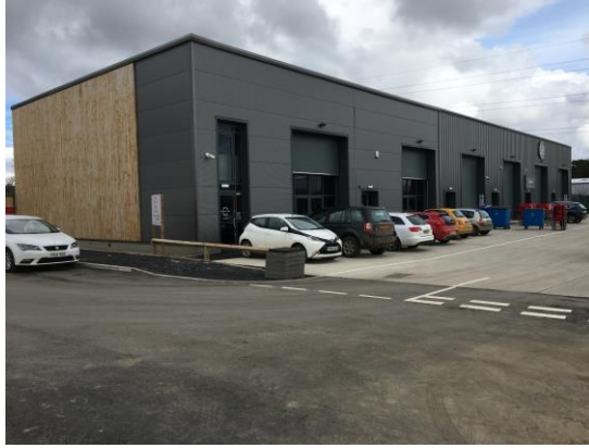
Plot 5a Units 1 – 6