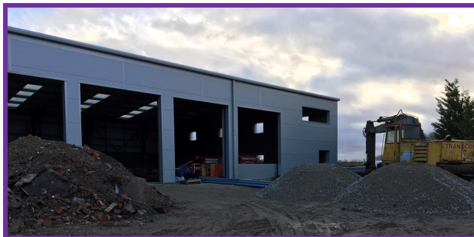
The buildings during construction