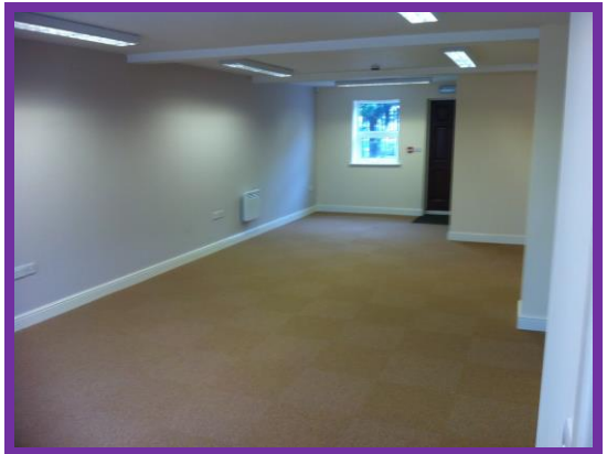
Indicative interior photos