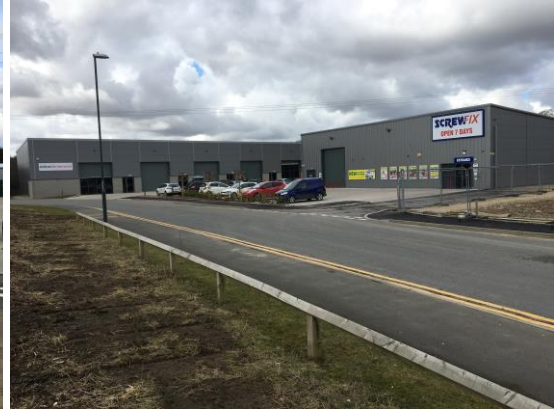
Units already built at MEP