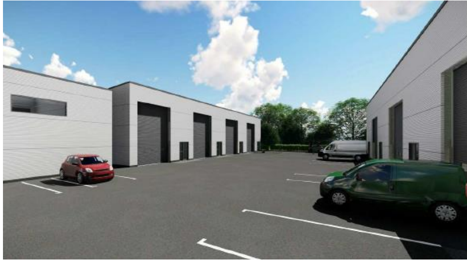
CGIs for indicative guidance purposes only