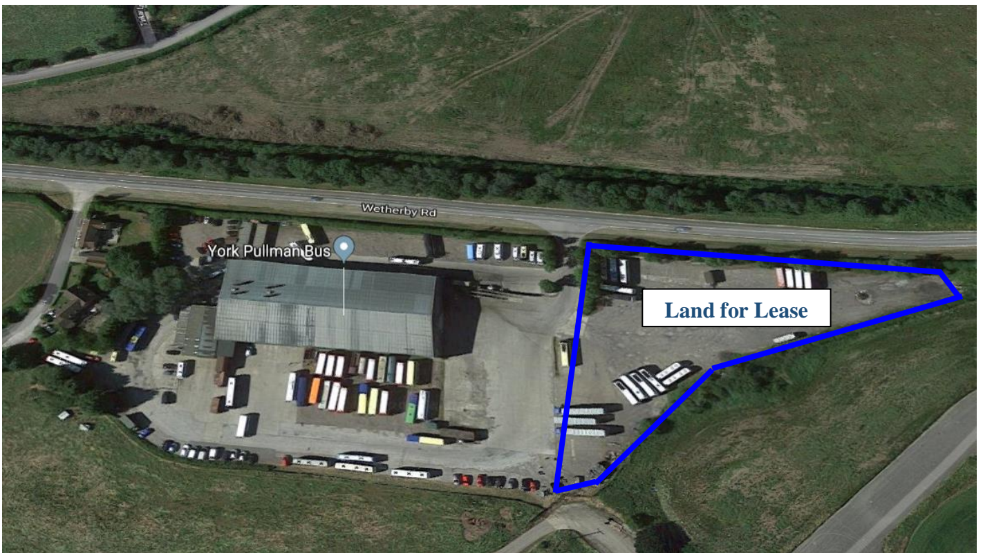
Approximate boundary only