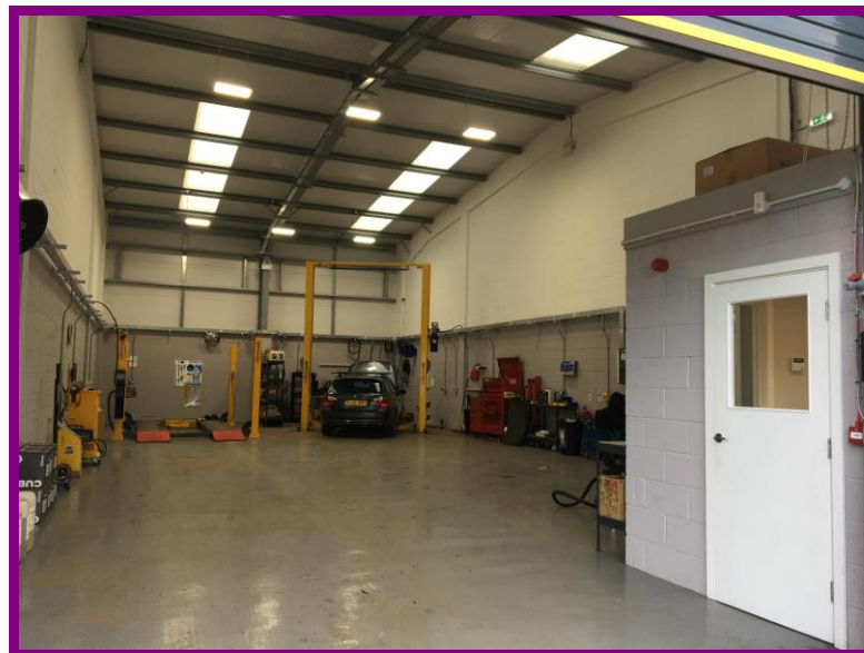
Interior of Unit 4E