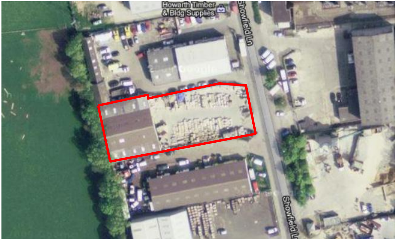
The boundary marked in red is approximate and for guidance purposes only