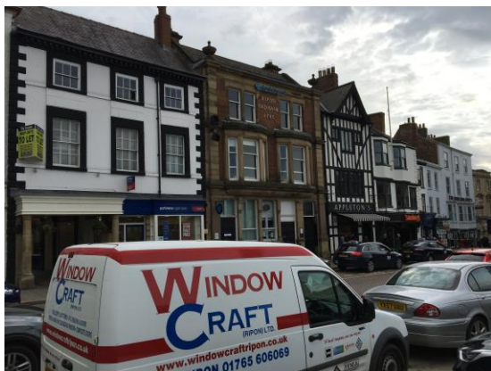
Ripon Market Place