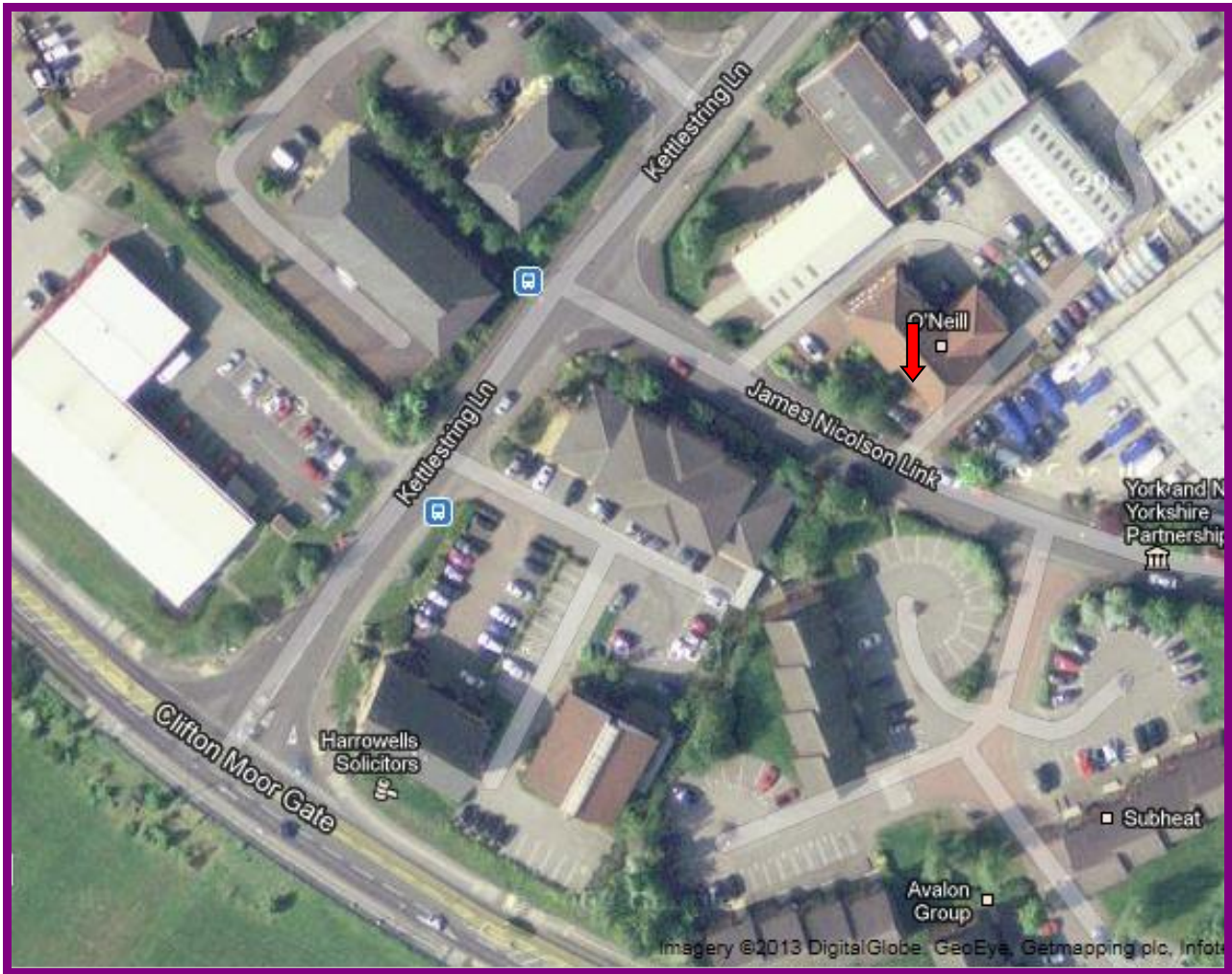
The plans are for identification purposes only