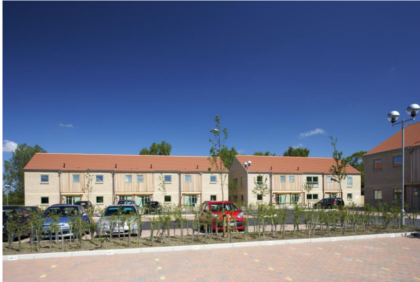
adjacent units at the development