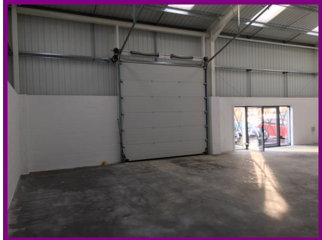
Unit 2 prior to previous letting