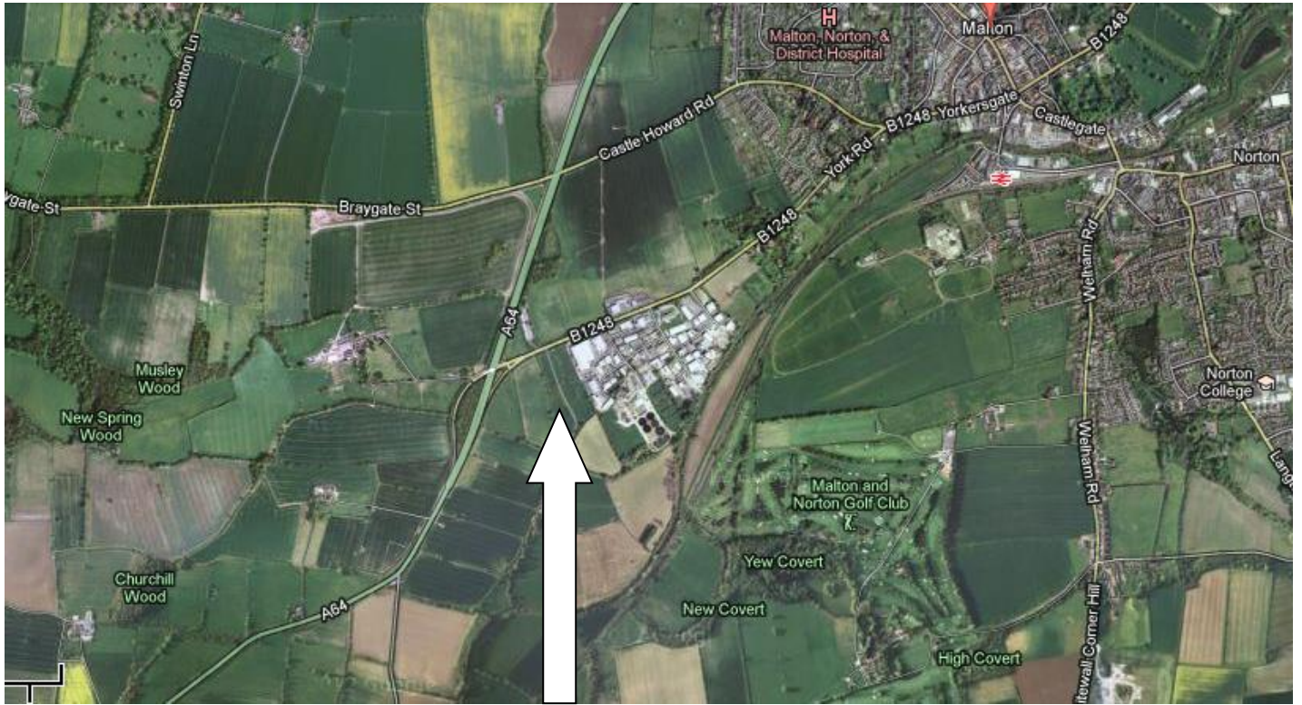
All artists impressions and plans for guidance purposes only and are not to scale