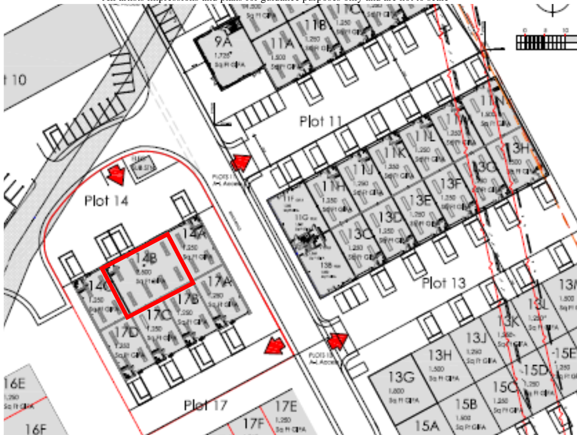
The units are shown edged red