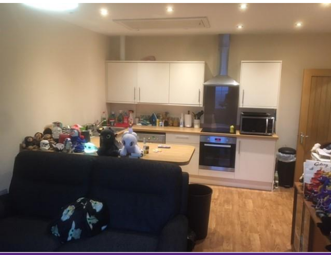
IMPORTANT NOTICE McBeath Property Consultancy Ltd, their clients and any joint agents give notice that: They have no authority to make or give any representations or warranties in relation to the property. These particulars do not form part of any offer or contract and must not be relied upon as statements or representations of fact. Any areas, measurements or distances are approximate. The text, photographs and plans are for guidance only and are not necessarily comprehensive. It should not be assumed that the property has all necessary planning, building regulation or other consents and McBeath Property Consultancy Ltd have not tested any services, equipment or facilities. Purchasers must satisfy themselves by inspection or otherwise.