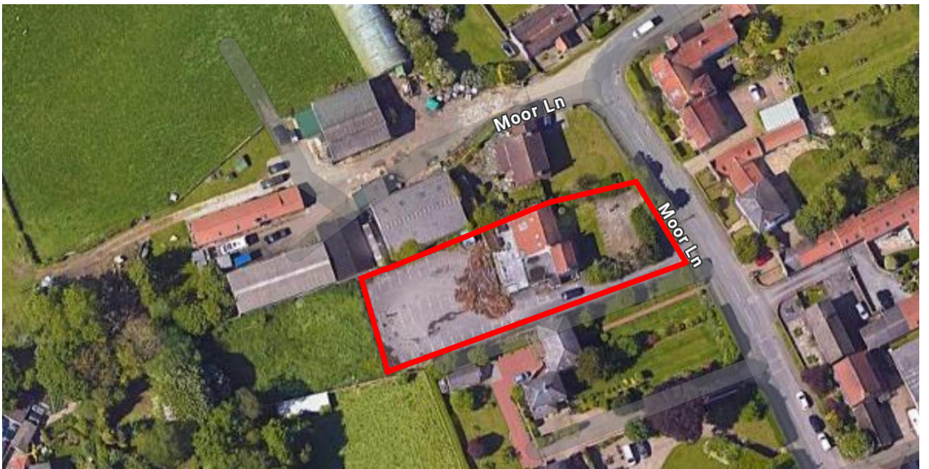
Approximate boundary for indicative purposes only – not to be relied on

IMPORTANT NOTICE McBeath Property Consultancy Ltd, their clients and any joint agents give notice that: They have no authority to make or give any representations or warranties in relation to the property. These particulars do not form part of any offer or contract and must not be relied upon as statements or representations of fact. Any areas, measurements or distances are approximate. The text, photographs and plans are for guidance only and are not necessarily comprehensive. It should not be assumed that the property has all necessary planning, building regulation or other consents and McBeath Property Consultancy Ltd have not tested any services, equipment or facilities. Purchasers must satisfy themselves by inspection or otherwise.