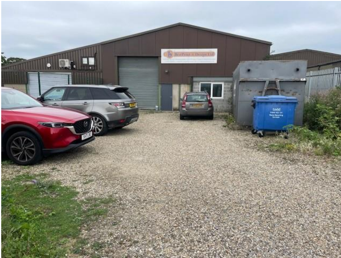
Industrial/warehouse unit with offices, storage and yard