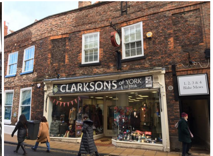
No 5 Blake Street

IMPORTANT NOTICE McBeath Property Consultancy Ltd, their clients and any joint agents give notice that: They have no authority to make or give any representations or warranties in relation to the property. These particulars do not form part of any offer or contract and must not be relied upon as statements or representations of fact. Any areas, measurements or distances are approximate. The text, photographs and plans are for guidance only and are not necessarily comprehensive. It should not be assumed that the property has all necessary planning, building regulation or other consents and McBeath Property Consultancy Ltd have not tested any services, equipment or facilities. Purchasers must satisfy themselves by inspection or otherwise.