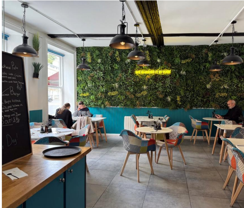
No3 Blake Street